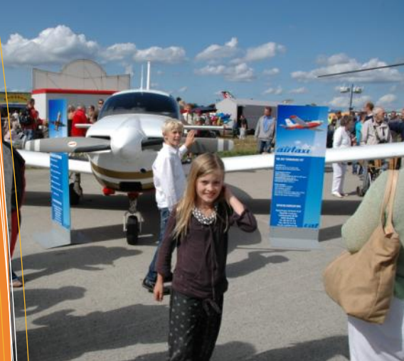
Atmosphere from Airshow 2009

We assign booths and sponsorships on a first-come first-served principle. If you already have participated in Roskilde Airshow earlier, you know that you get in touch with thousands of potential customers