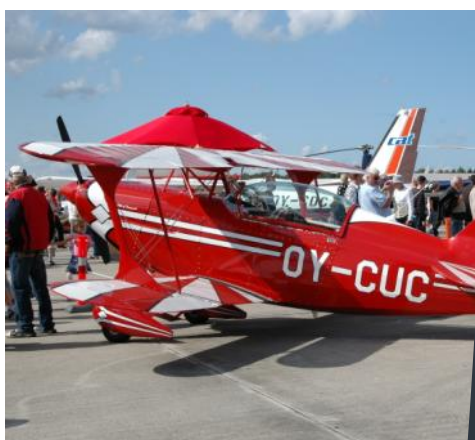
The above picture shows OY-CUC, model Pitts S-2B 1991 from Aviat Aircraft Inc.

The picture below shows the DC-3 with registration OY-BPB (still flying), but originally belonged to the Danish Air Force (ENC 721). Last flight for the Danish Air Force took place 30 July 1982.